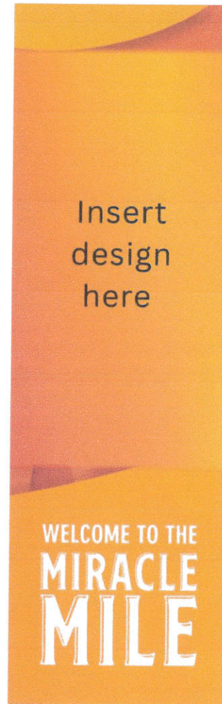
Proposed New Sponsored Banner Layout